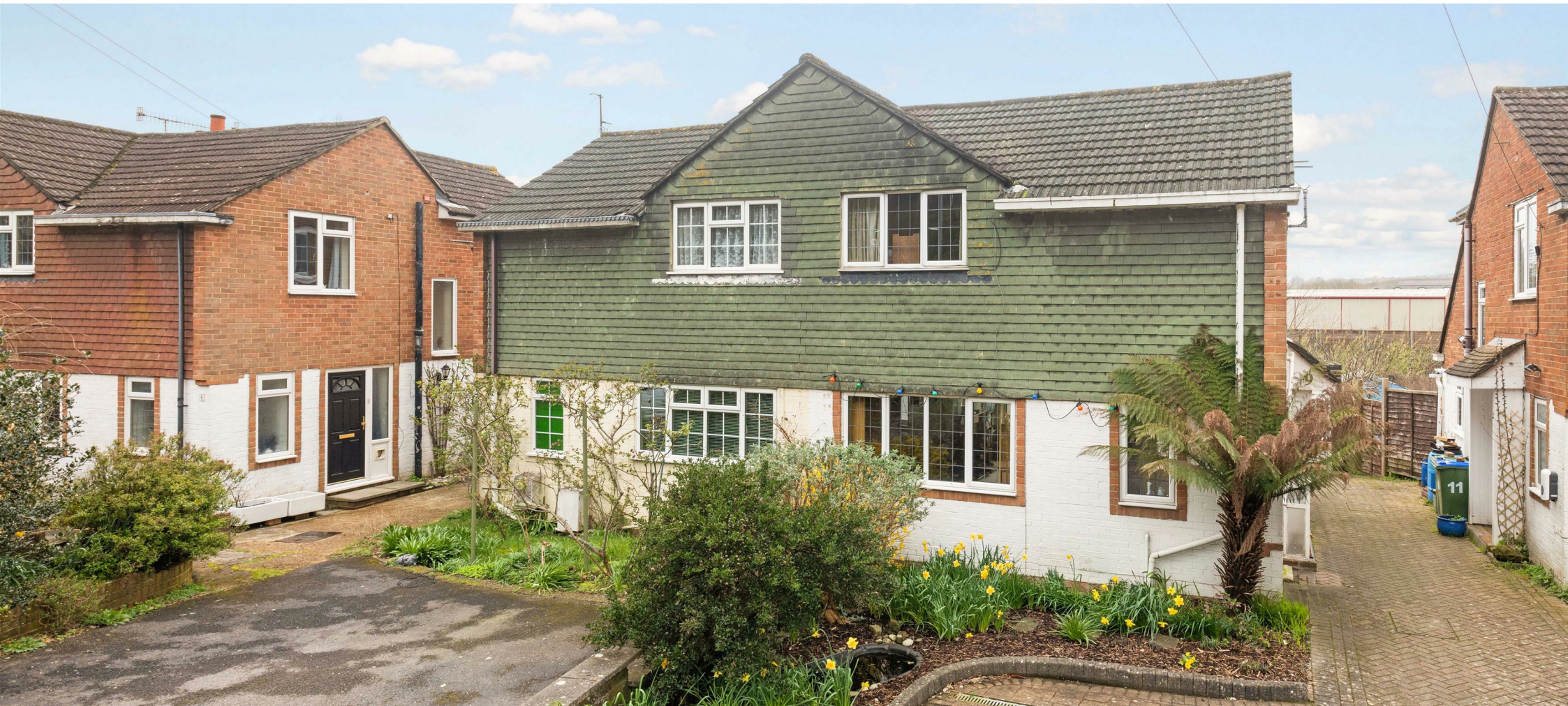
Orchard Road, Lewes